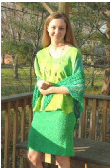
Lime Mini Skirt